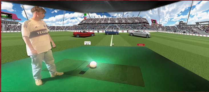
SURROUND SOCCER SIMULATOR - SAN DIEGO