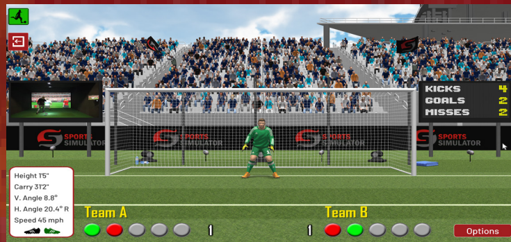
SAN DIEGO - SHOOTOUT CHALLENGE