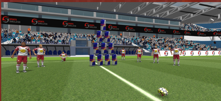
NEW YORK STADIUM - CAN CHALLENGE