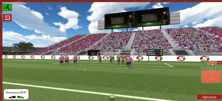
MIAMI STADIUM - FREE KICK CHALLENGE