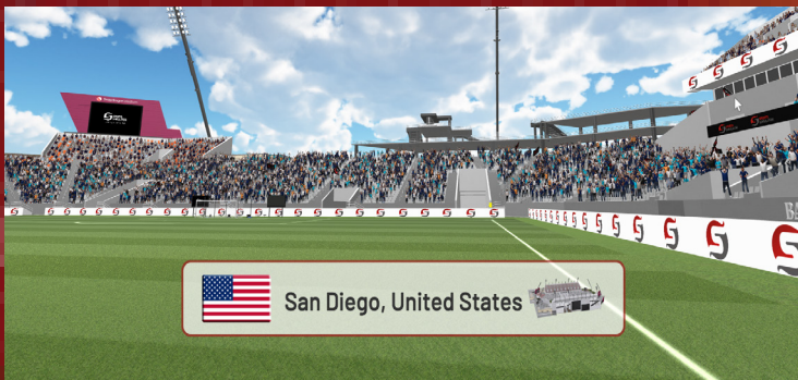
SAN DIEGO - INSIDE STADIUM FLYTHROUGH